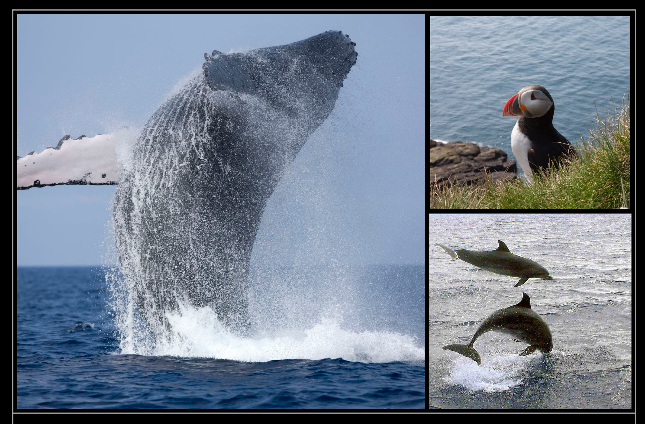
Whale Watching & Puffin Watching

Season: All year (best time is April - September)