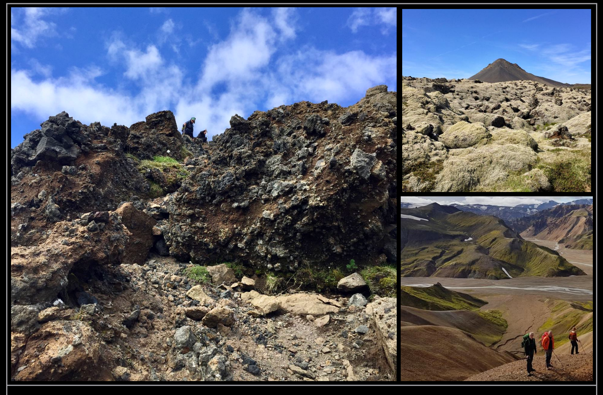
Climbing Mount Keilir, created from sub-glacial eruptions during the Ice Age Season: All year HL Adventure