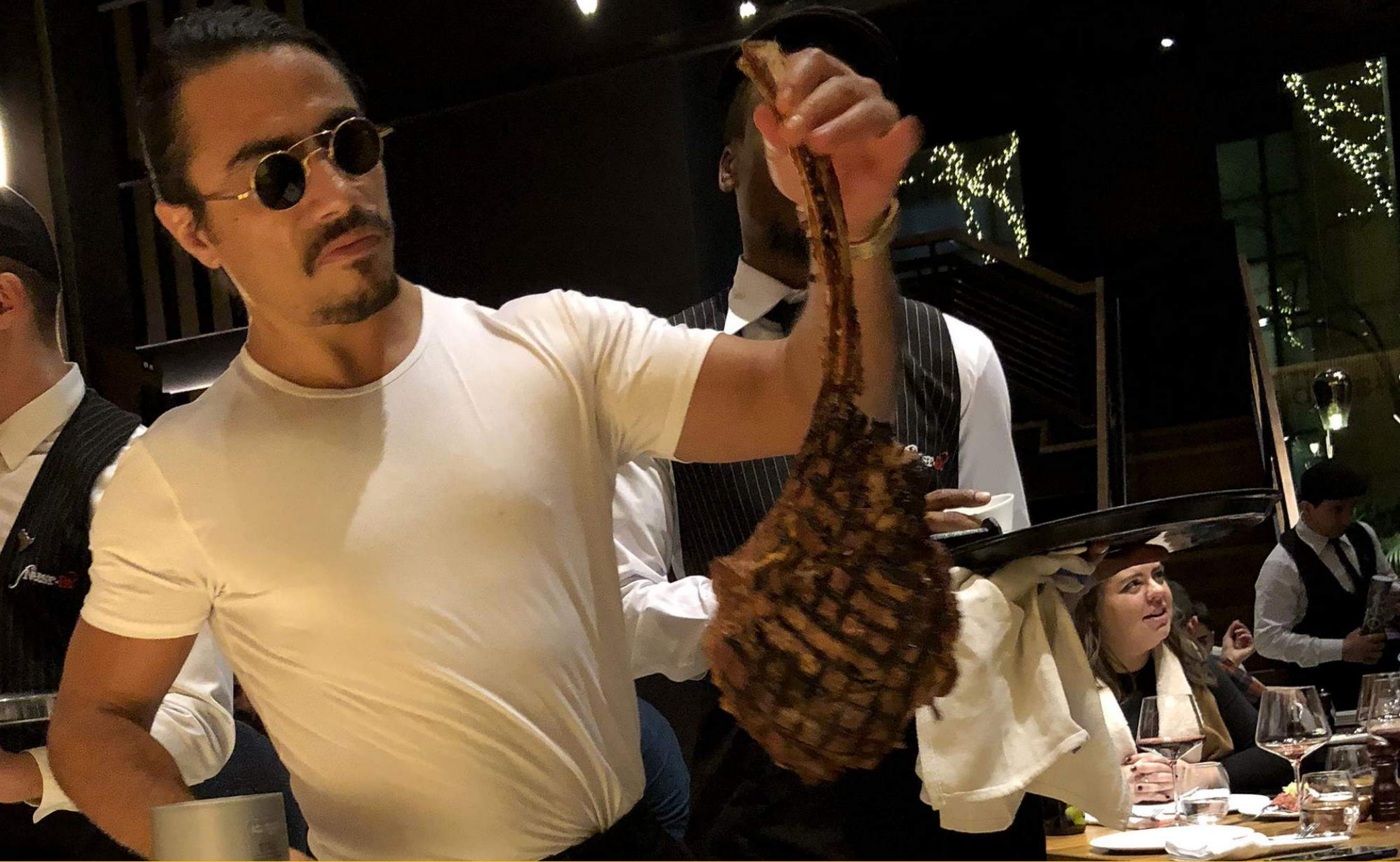
VENUE SELECTION: SALT BAE EXPERIENCE AT NUSR-ET STEAK HOUSE