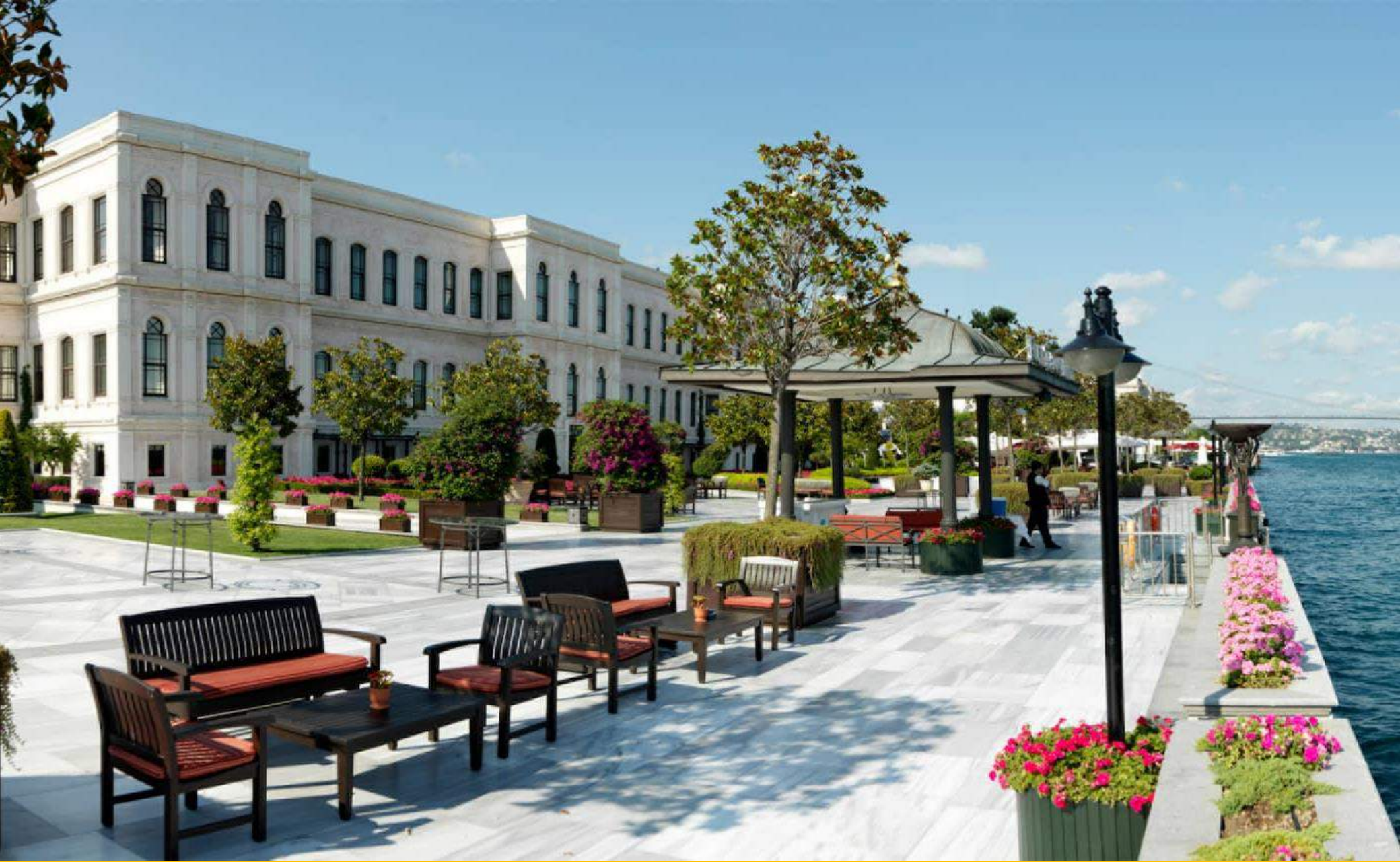
HOTEL SELECTION: FOUR SEASONS AT THE BOSPHORUS