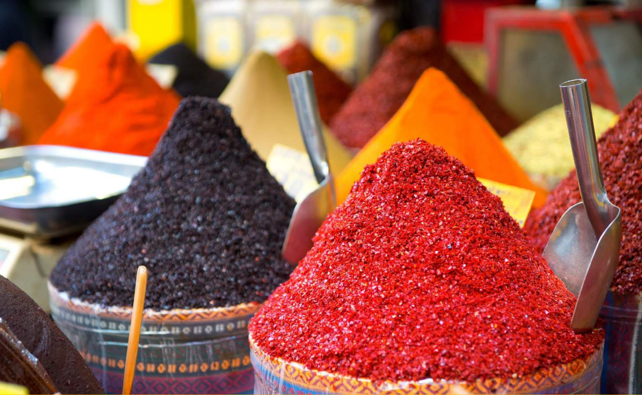
HIGHLIGHTS: SPICE MARKET