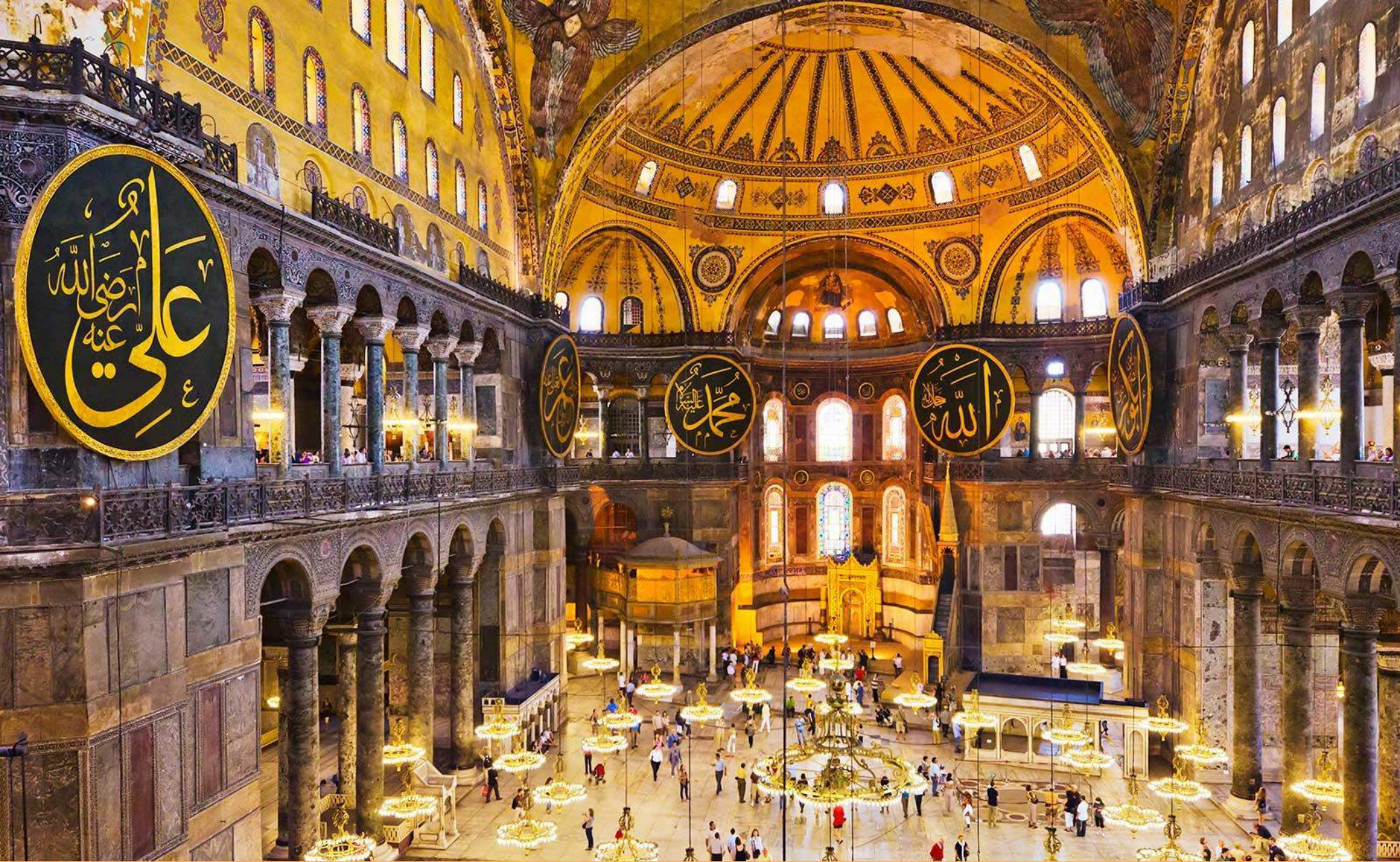
HIGHLIGHTS: HAGIA SOPHIA CHURCH