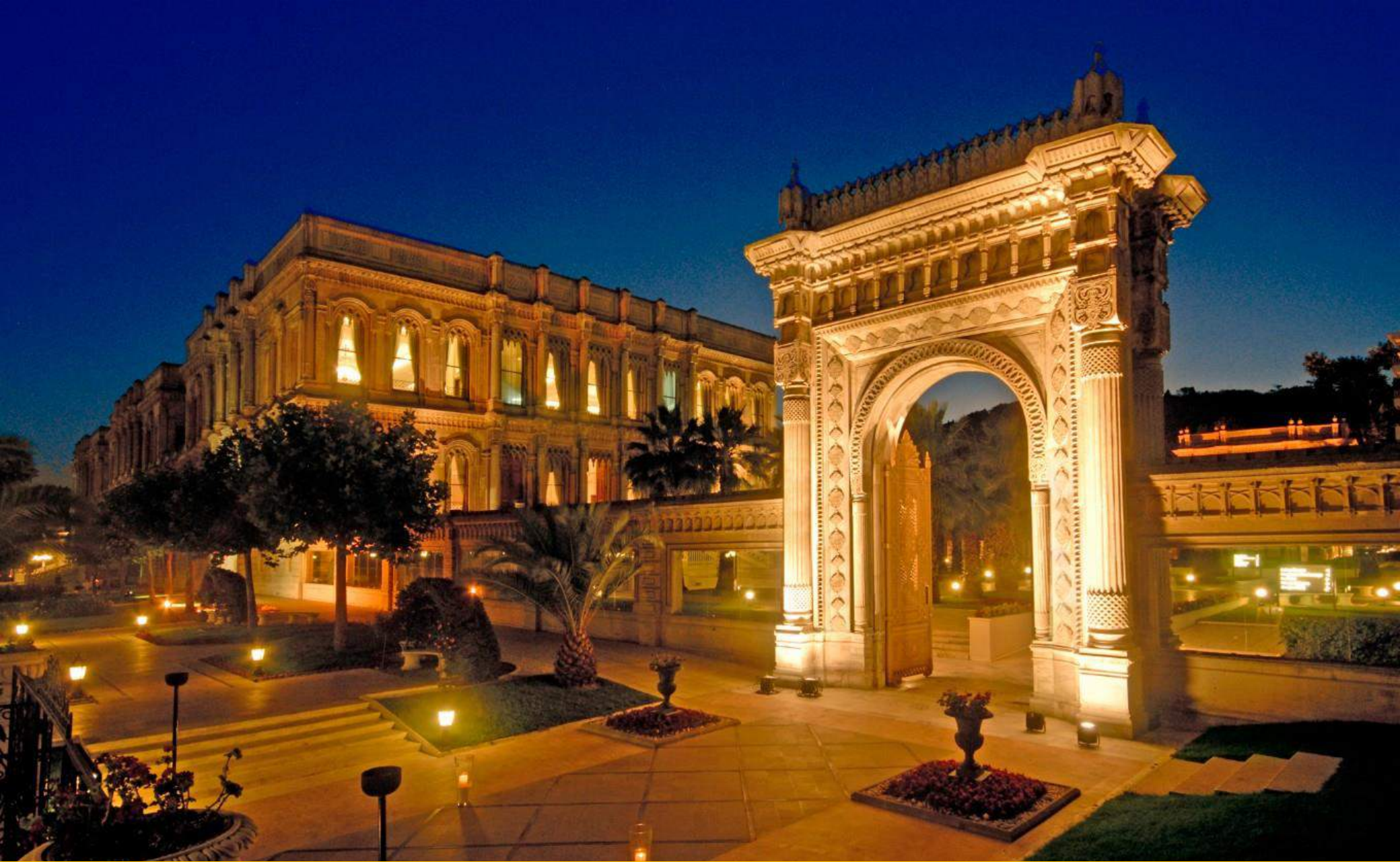
HOTEL SELECTION: CIRAGAN PALACE KEMPINSKI