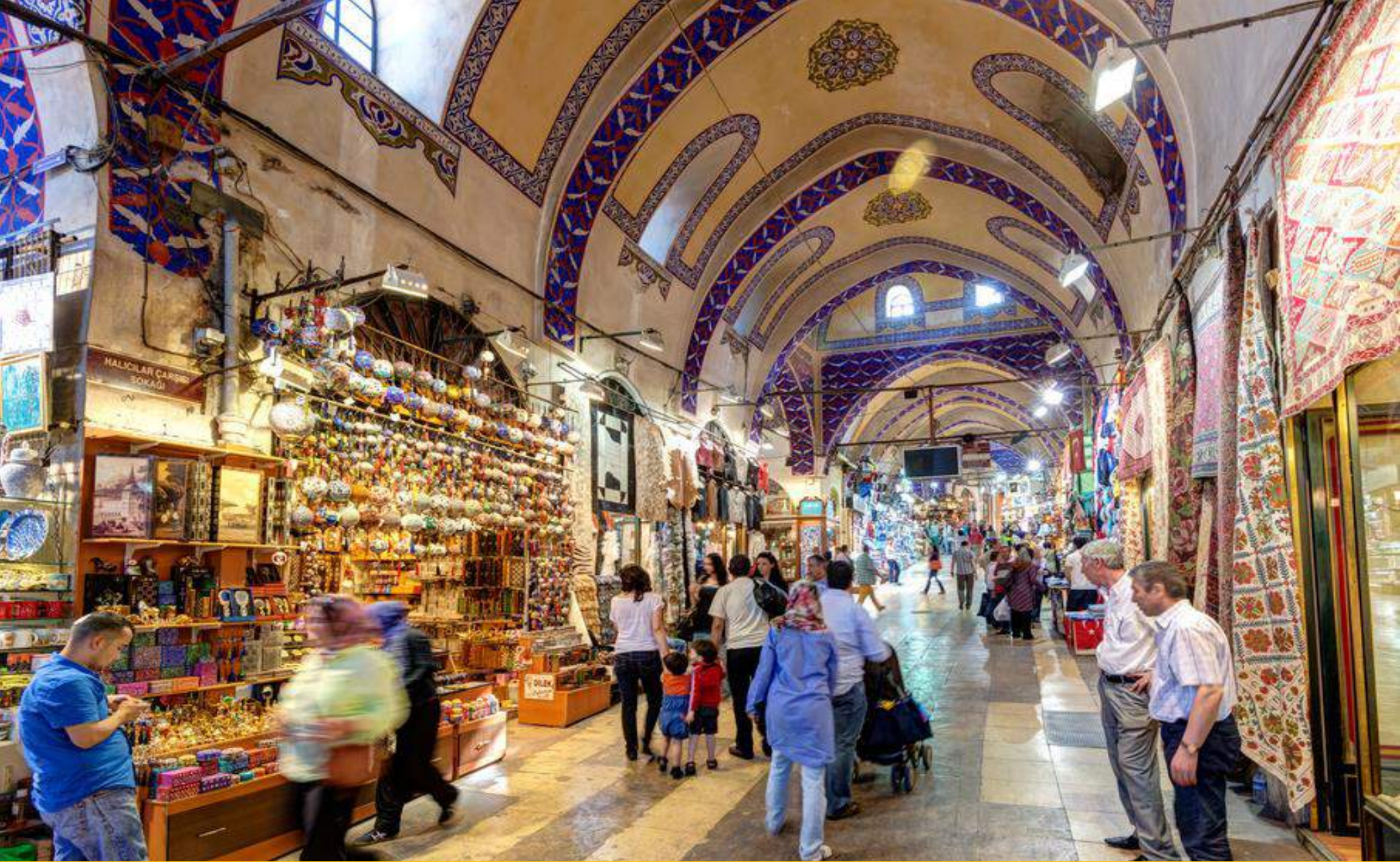
HIGHLIGHTS: GRAND BAZAAR