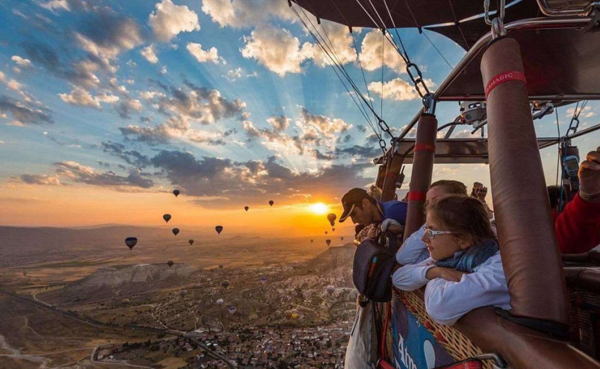
HOT AIR BALLOON