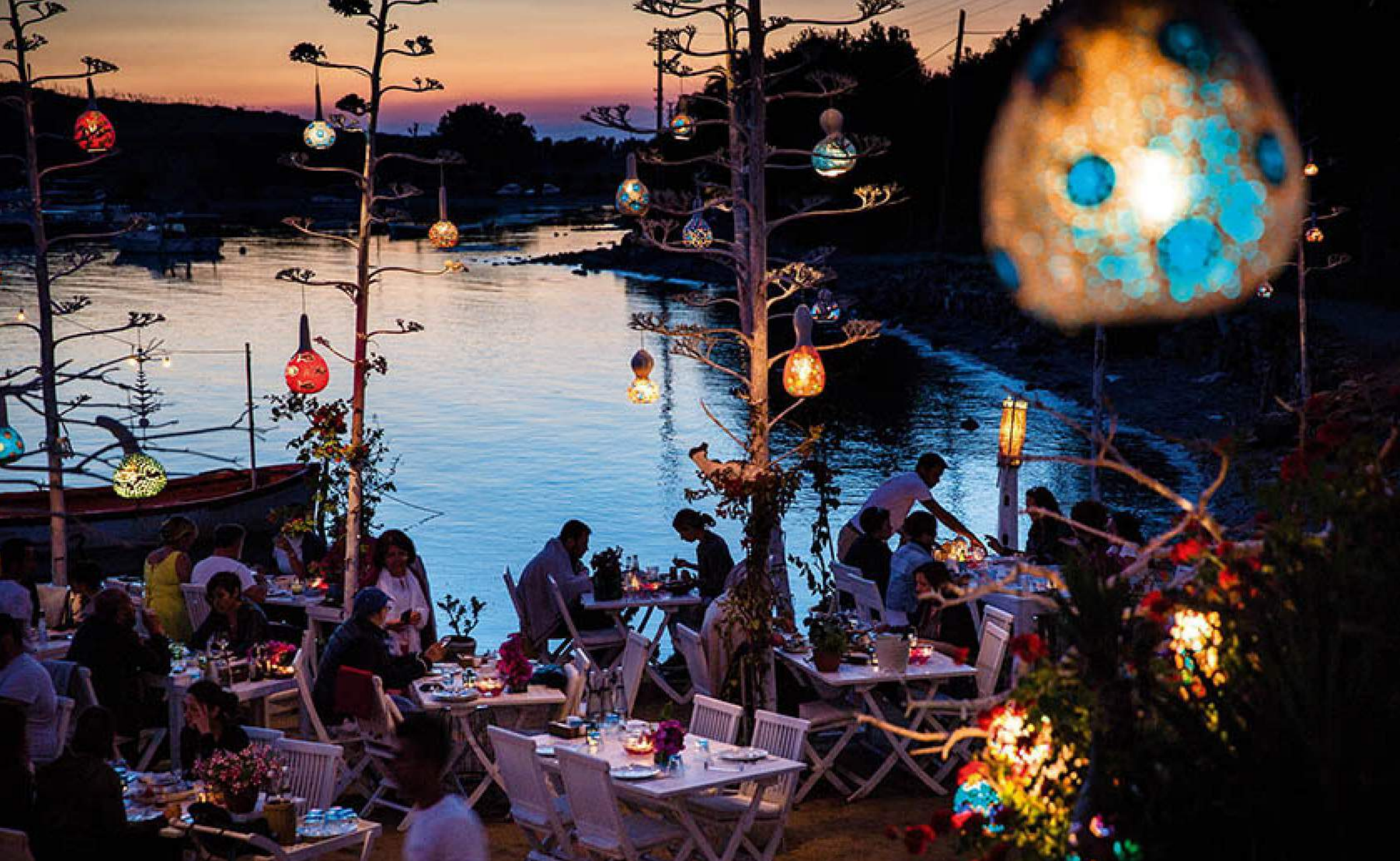
GUMUSLUK BAY – FISH RESTAURANTS