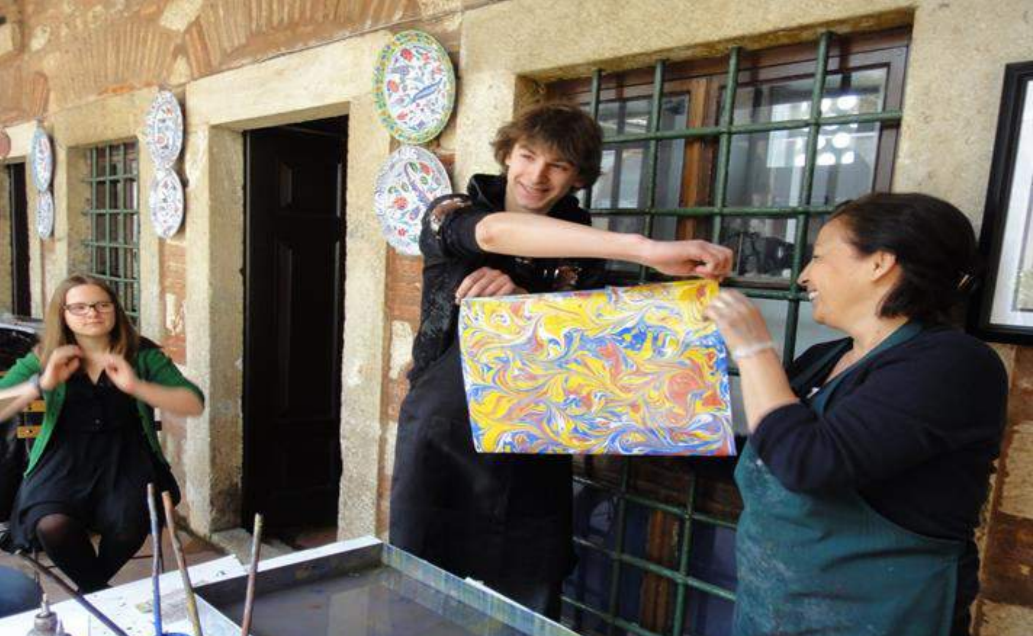
PAPER MARBLING WORKSHOP