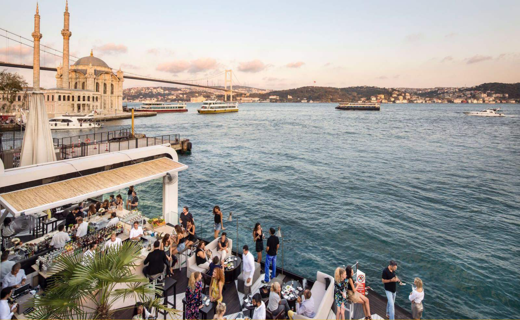
VENUE SELECTION: RUBY RESTAURANT & CLUB