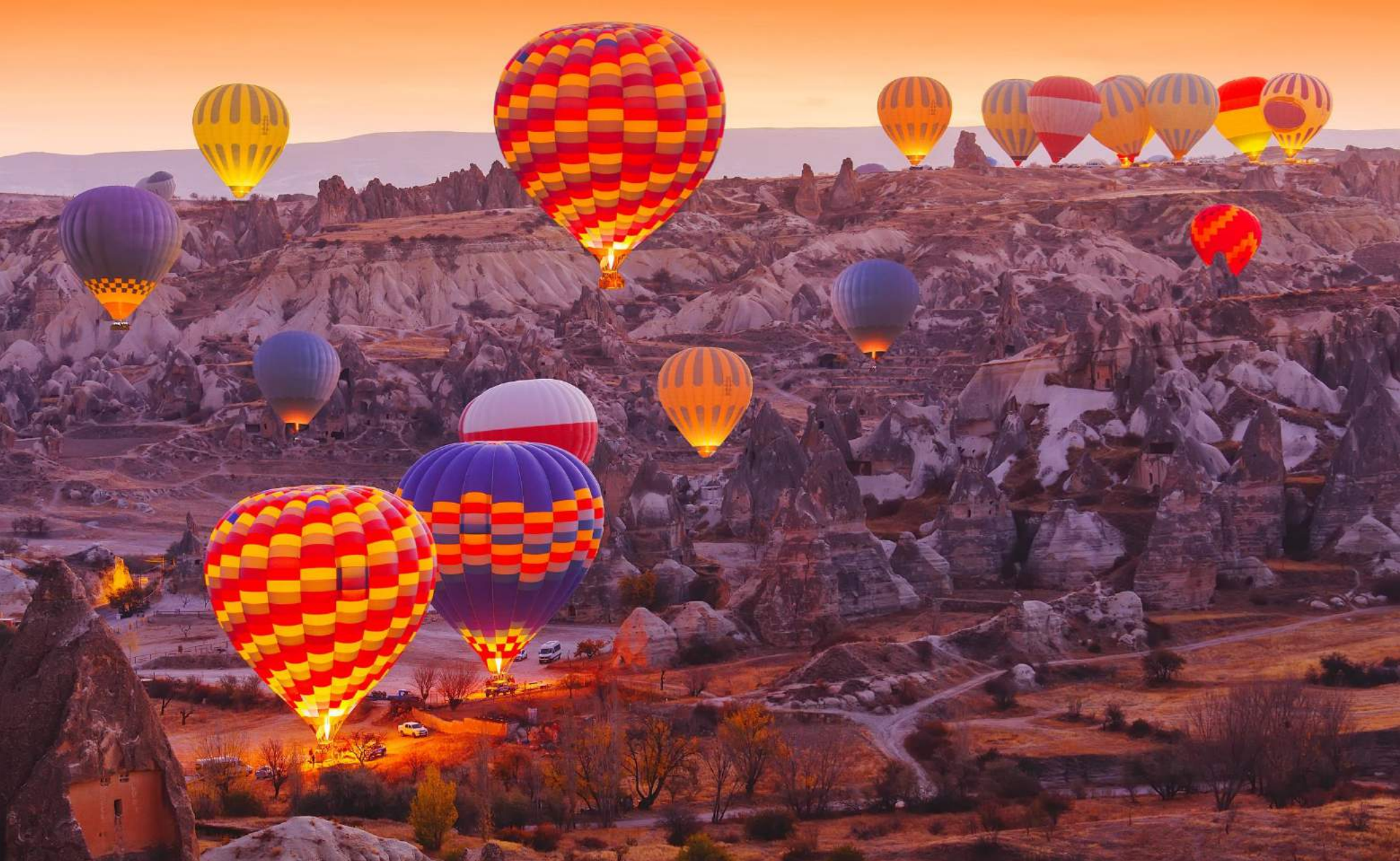
HOT AIR BALLOON