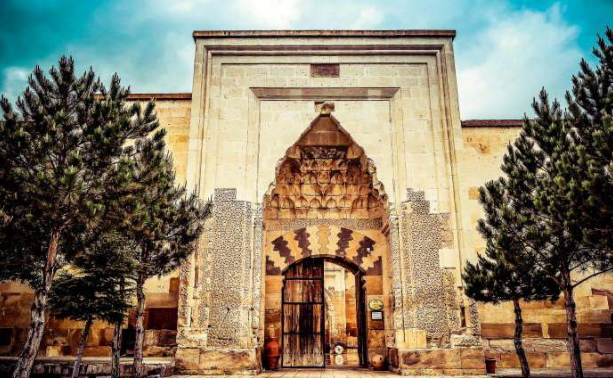
HIGHLIGHTS : SARUHAN CARAVANSARAI