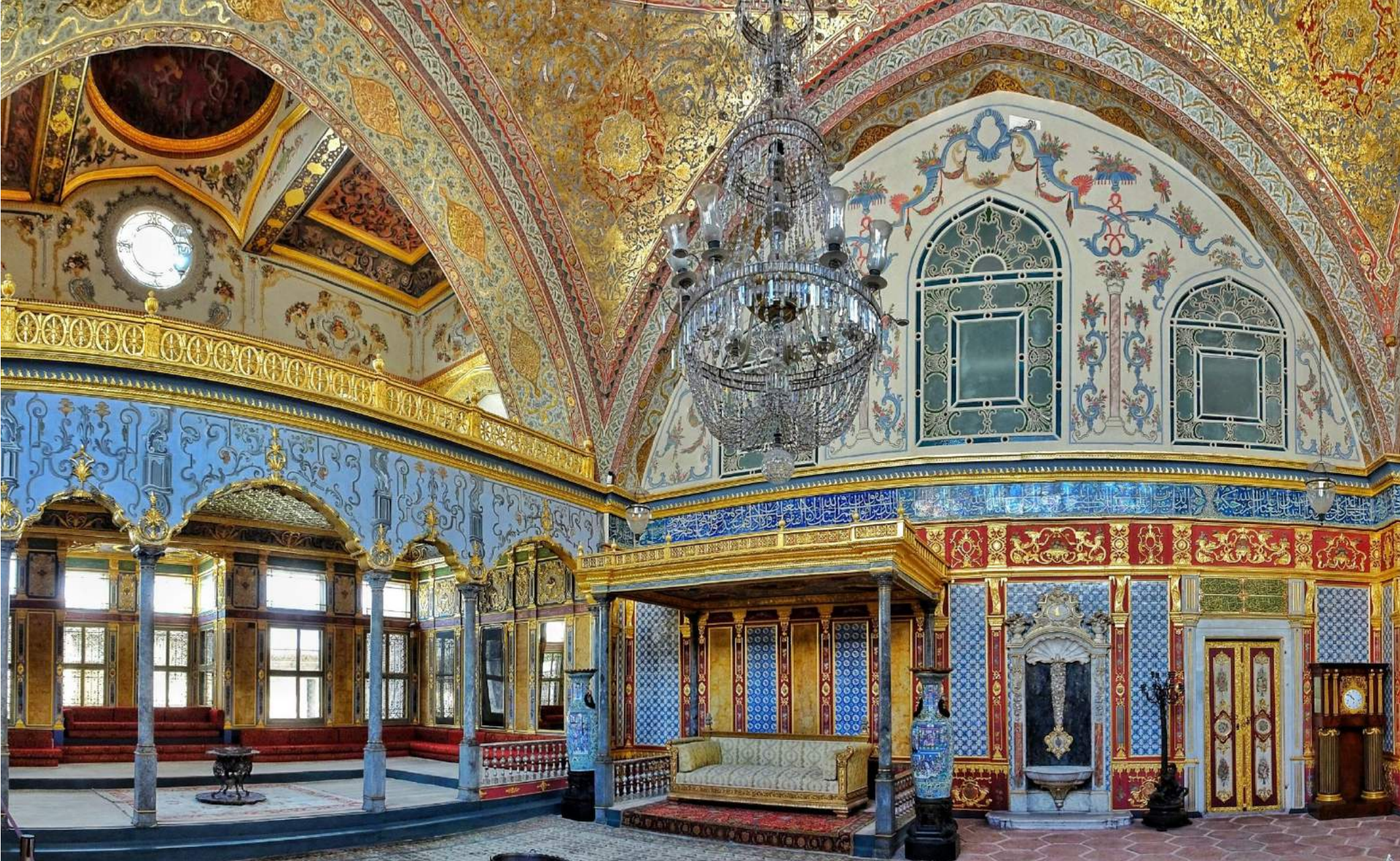
HIGHLIGHTS: TOPKAPI PALACE