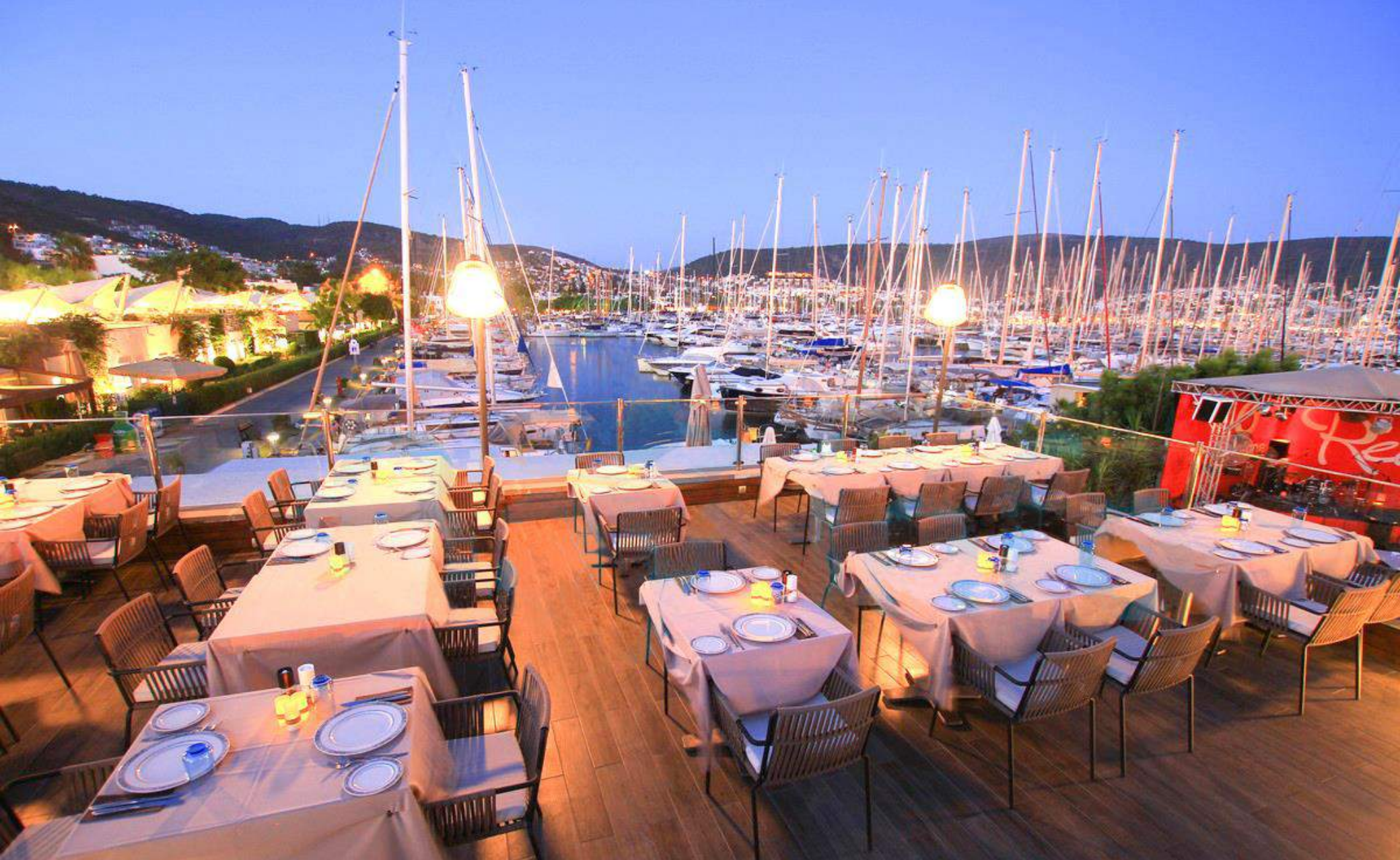
MARINA YACHT CLUB - BODRUM