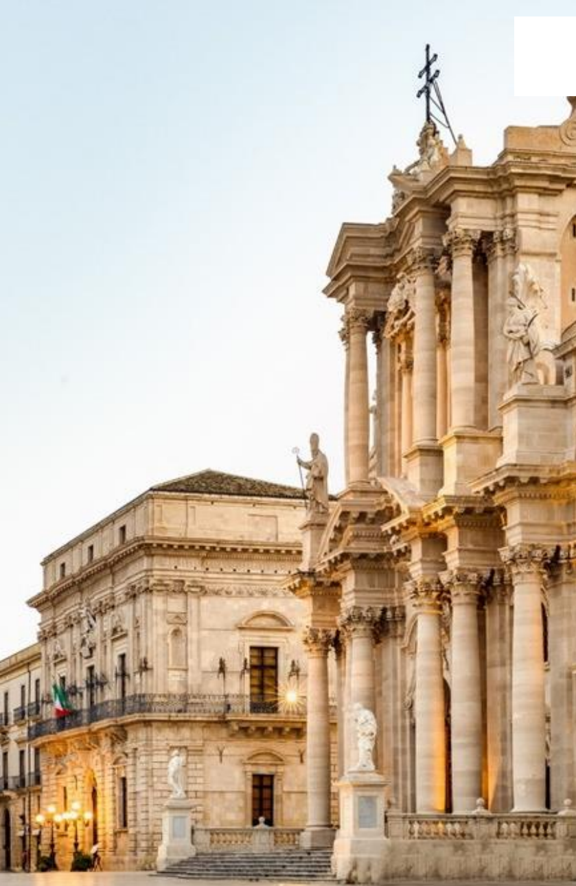
Tour of the Sicilian Baroque